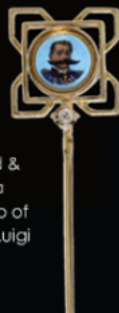
Small brooch in gold & diamonds, Murrina representing Umberto of Savoia - Vincenzo & Luigi Moretti 1890