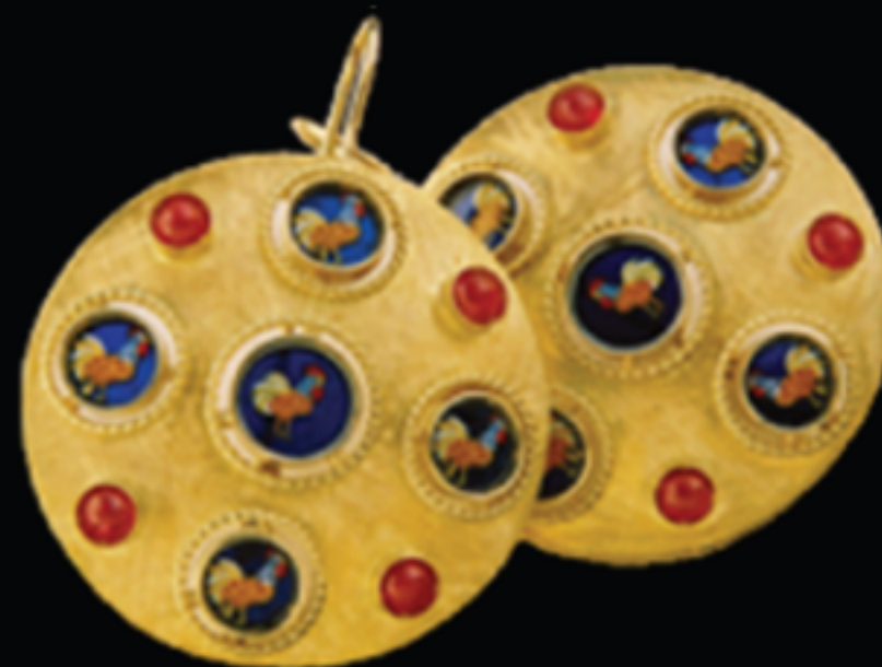
Drop earrings in chiselled gold and sapphires, ten Murrine "The Rooster" - U. Moretti 1924