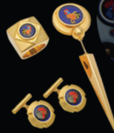
Male twins, brooch and ring in gold, Murrina "The Rooster" U. Moretti 1924