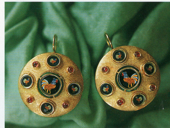
D rop earrings in chiselled gold and sapphire, with five Murrine "Gallo" (1924 Ulderico Moretti)