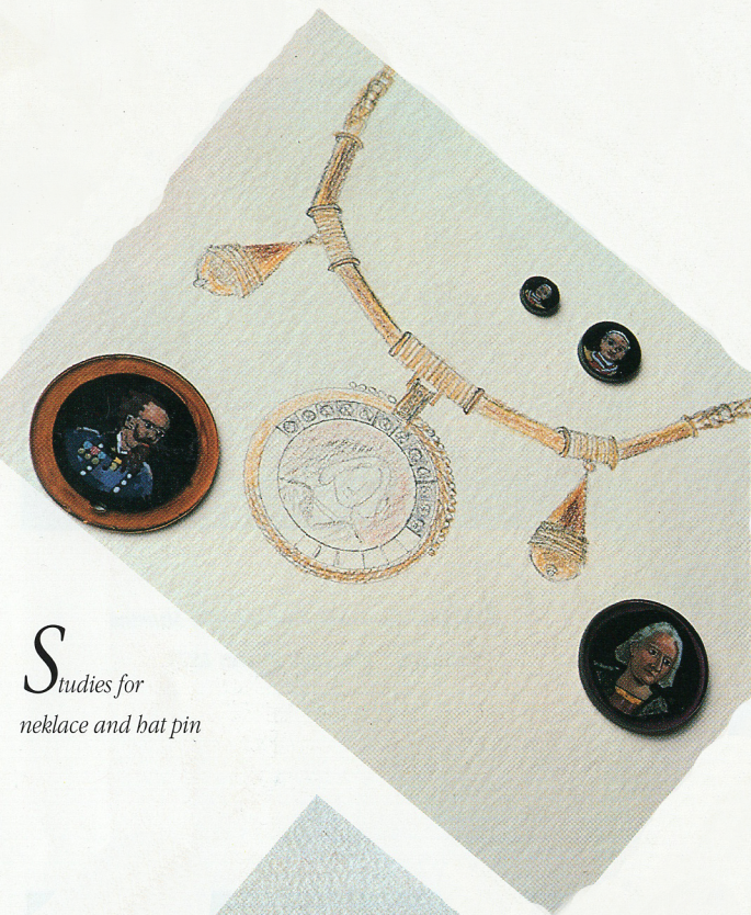
Studies for necklace and hat pin